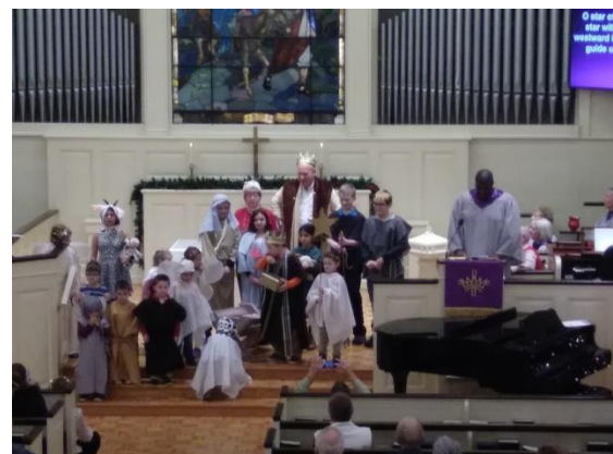
Intergenerational Christmas Pageant 2018