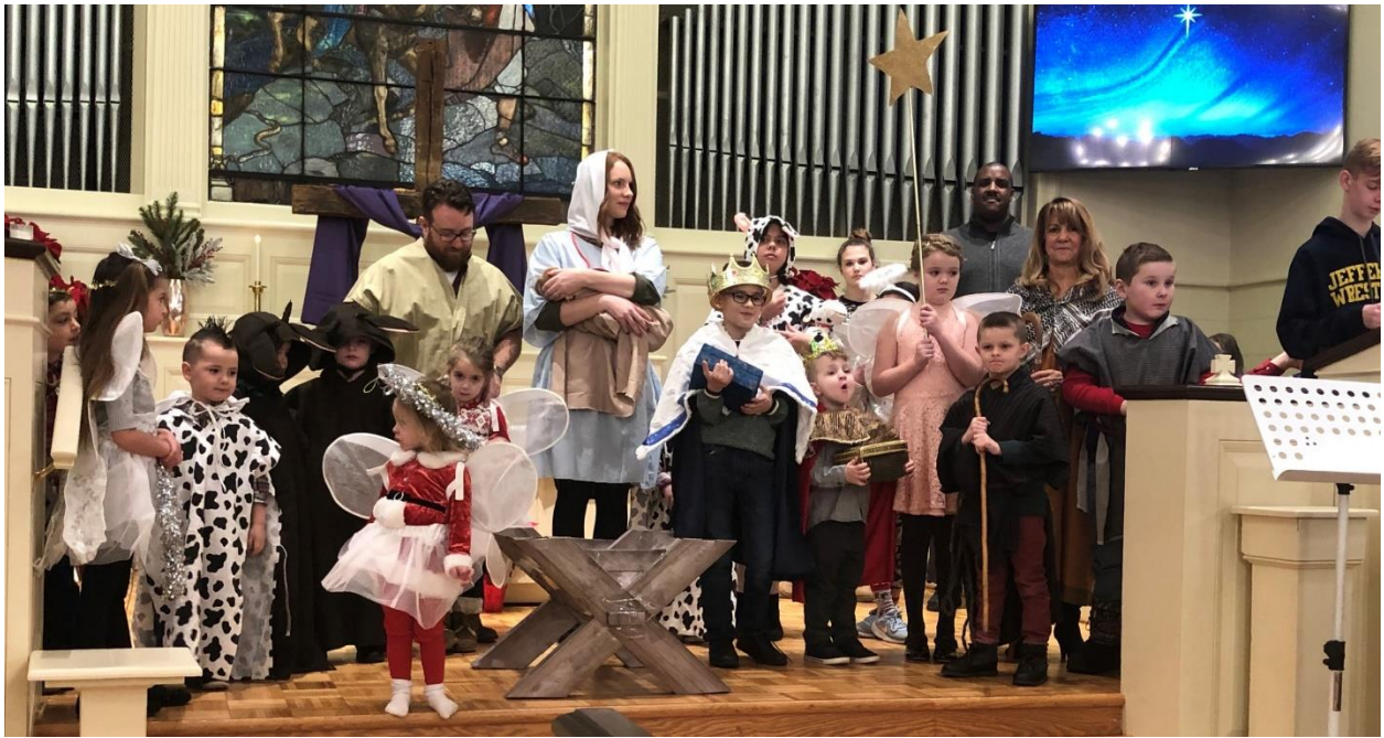
Intergenerational Christmas Pageant, 12/22/19