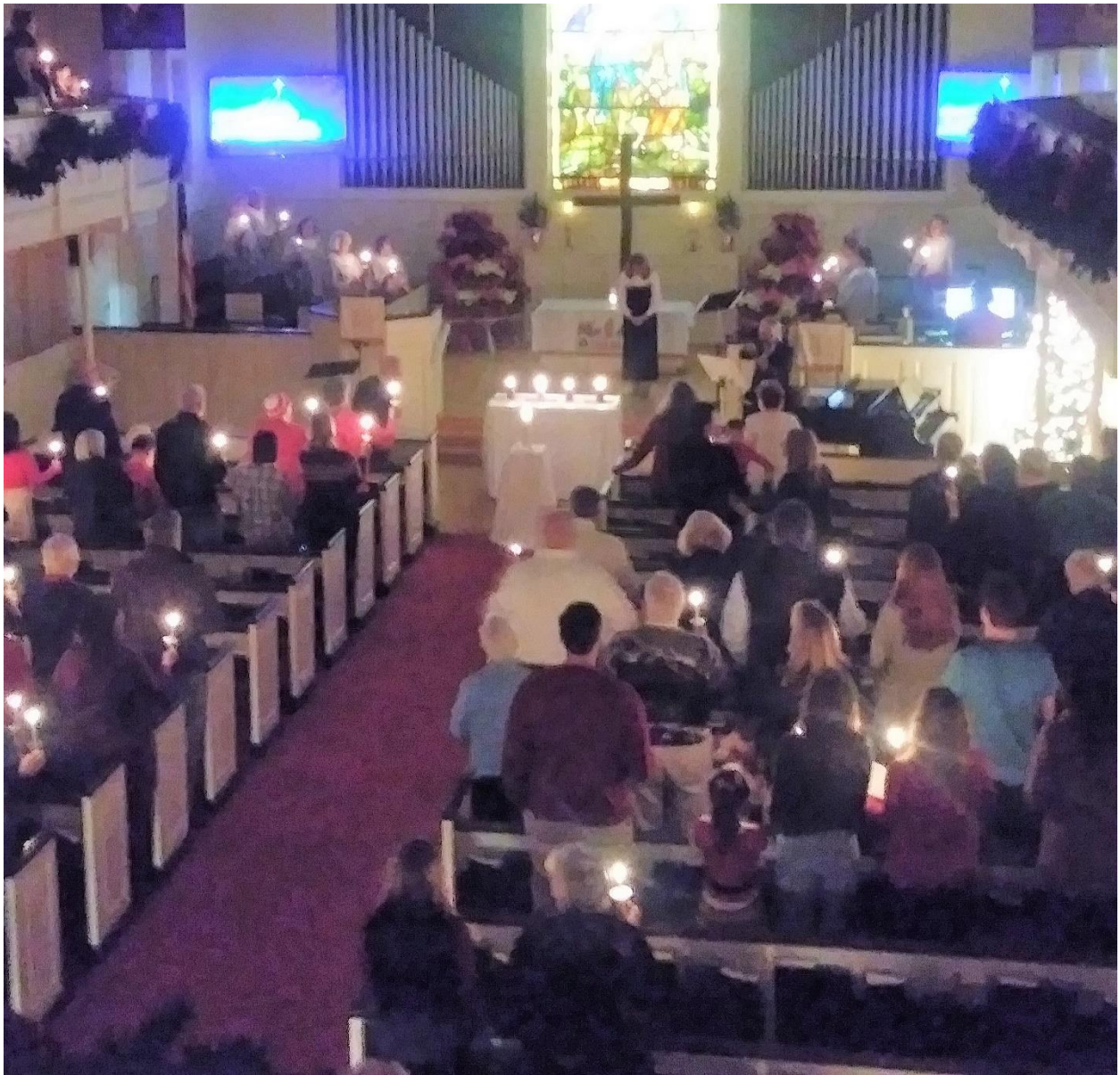
Christmas Eve Service, 12/24/19