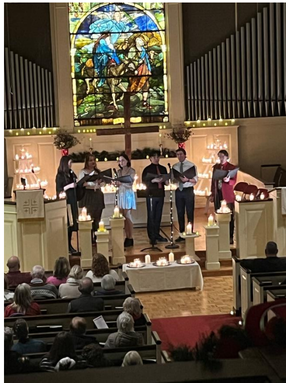
Stageworks Candlelight Christmas Concert